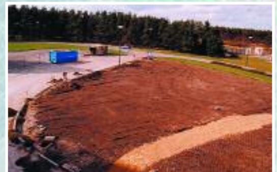
D61 roundhouse demolition completed.