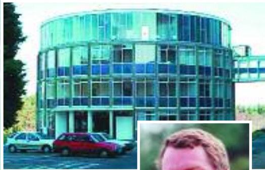
D61 roundhouse before demolition.