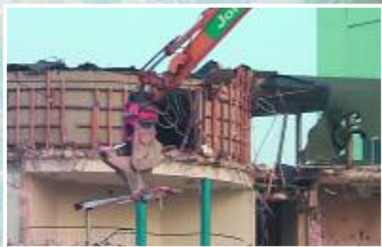
D61 roundhouse demolition.

The Steam Generating Heavy Water Reactor's (SGHWR) administration building (D61) was built in 1967 to provide accommodation for the support staff for SGHWR operations. The building was occupied until 1997 by up to about 120 people. Following initial decommissioning the facility was kept in care and maintenance. New offices within the north annexe of the main building were provided rendering the large office block redundant.